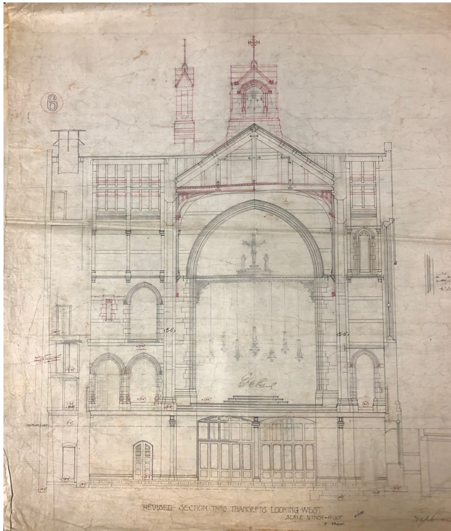
Office of Charles Coolidge Haight, Cross section of interior elevation of the Church looking West, pen and ink on paper, ca. 1901. (New York, Archives of the Episcopal Diocese of New York)

Churchwarden and Chair, Saint Ignatius at 150 Capital Campaign