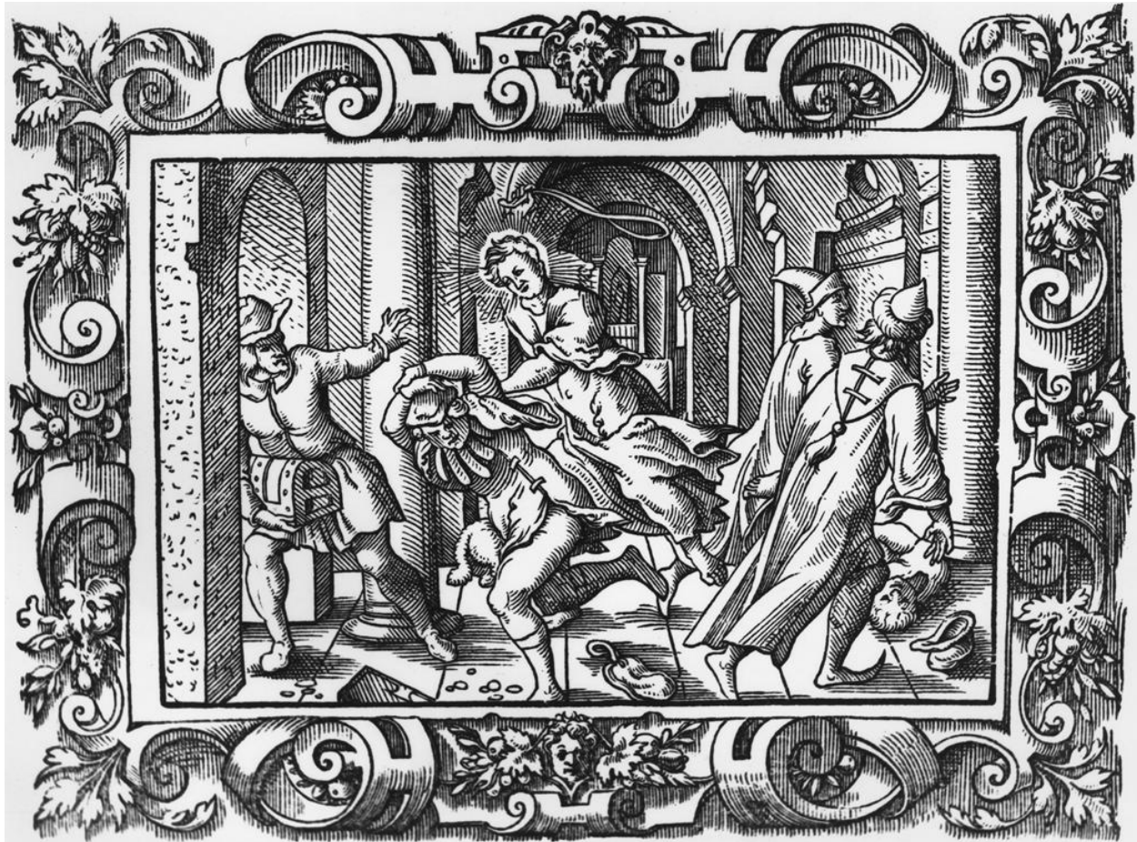
Jesus driving the money changers from the Temple, etching, sixteenth century.

Thursday, Jan 12, 2023 06:07:43 PM GMT-8 - Accrual Basis