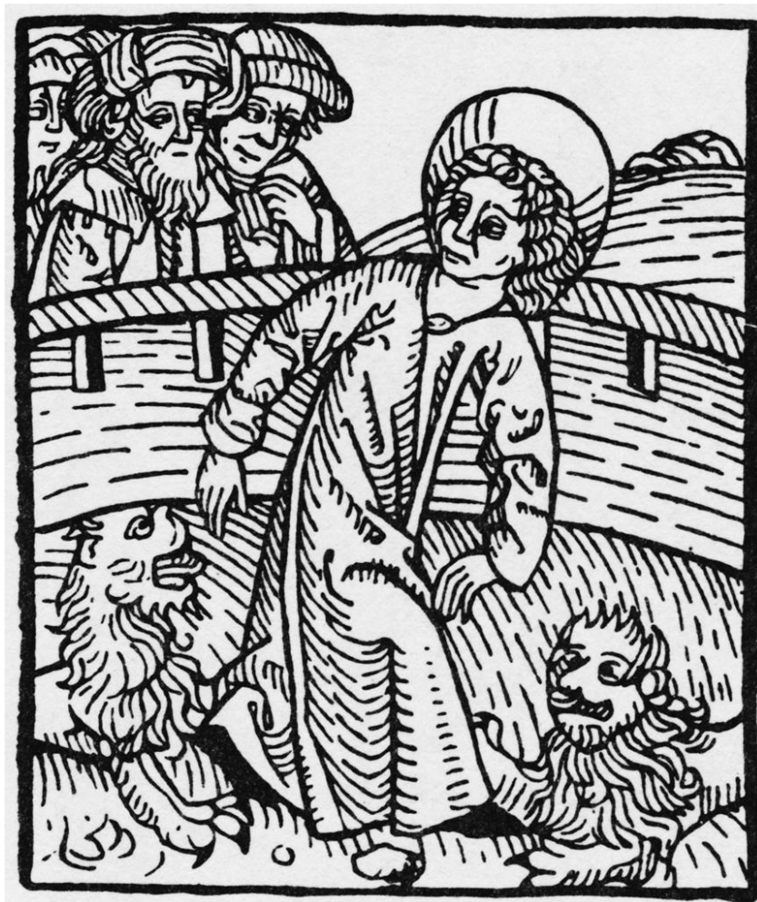
Anonymous Artist, The Martyrdom of Saint Ignatius of Antioch , woodcut, from Leben der Heiligen, Winterteil ([Germany], 12 November 1481)