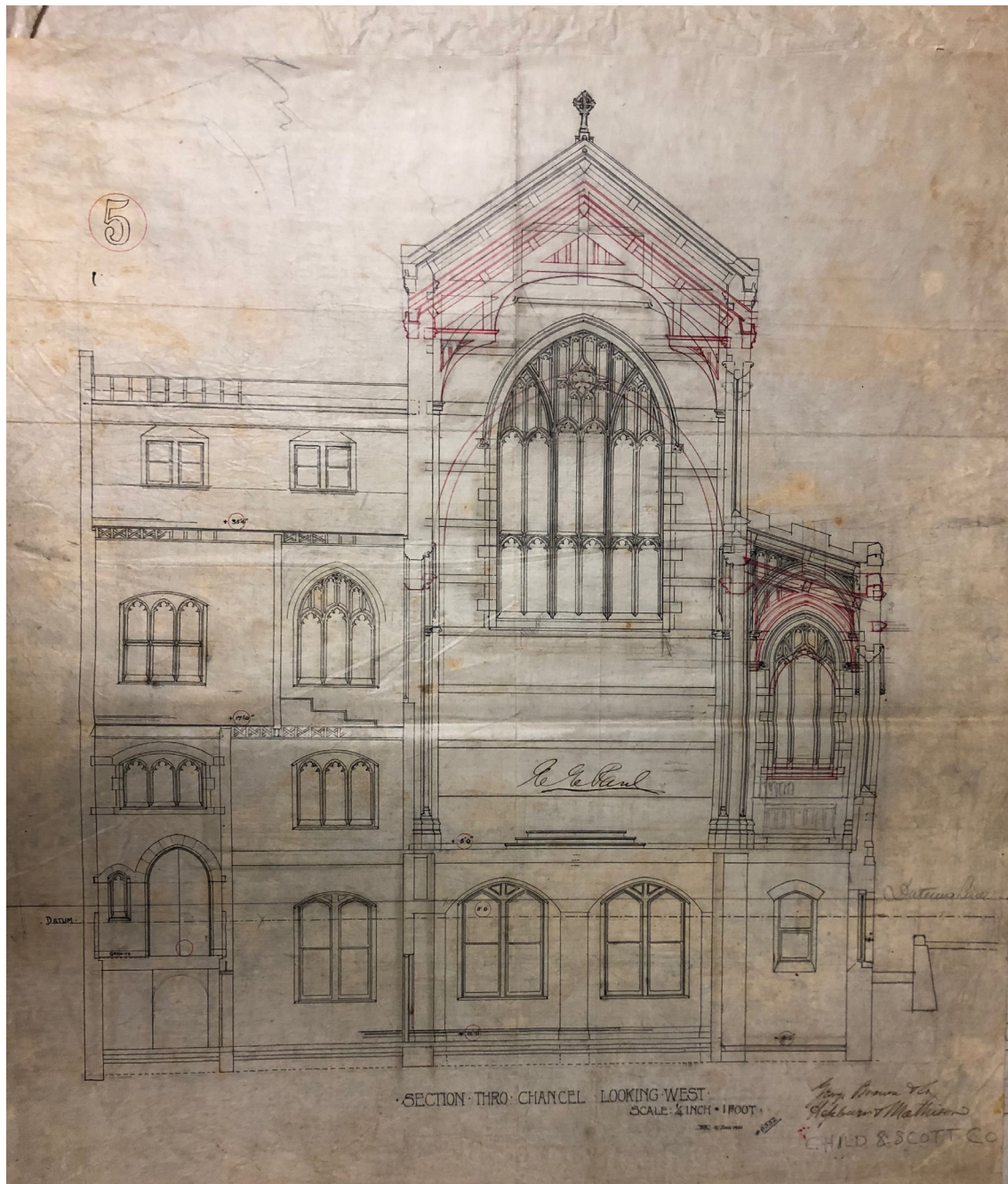
Office of Charles Coolidge Haight Interior view of West End Avenue elevation of the Church (looking West), pen and ink on paper, ca. 1901 (New York, Archives of the Episcopal Diocese of New York)