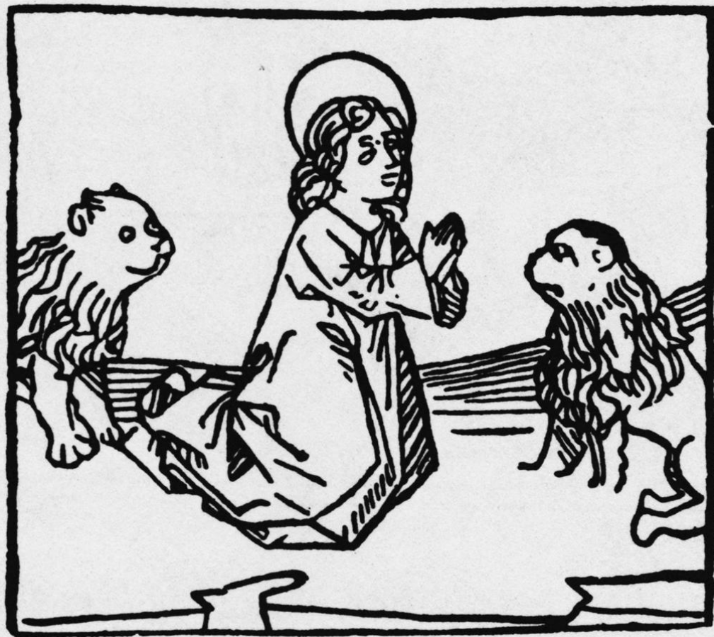
Anonymous Artist, The Martyrdom of Saint Ignatius of Antioch , woodcut, published in Das Leben der Heiligen [= The Golden Legend] ([Germany], 26 June 1480)